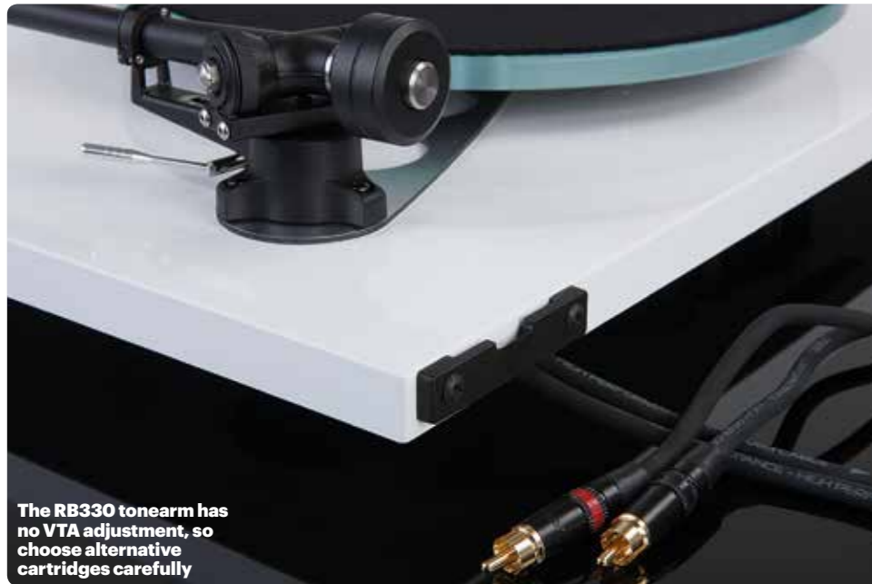
The RB330 tonearm has no VTA adjustment, so choose alternative cartridges carefully

the stiffer plinth, the Planar 3 is considerably more inert than any previous version, which should audibly reduce distortion.